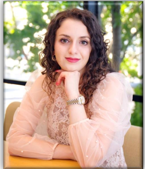
Author Dana Dargos

Learn more about Fremont Area Writers at cwc-fremontareawriters.org . FAW is one of 22 branches of the California Writers Club (CWC) calwriters.org .